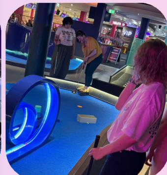
(Summer retreat fun with the team - mini golf!)