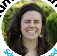
Schools Work Lead